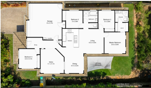
LJ Hooker Solutions Gold Coast 17 Gerard Street, Pacific Pines

LJ Hooker Coomera (07) 5585 7888 The Hub, 5/90 Days Road, UPPER COOMERA QLD 4209 coomera.ljhooker.com.au | coomera@ljhgc.com.au