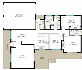
2/1 Silkyash Close, OLD BAR Floor Plan by James Green Photography, jamesgreen.com.au