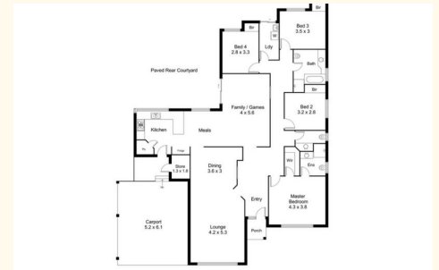
LJ Hooker 29 Diamond Drive, Ocean Reef

joondalup.ljhooker.com.au | admin.joondalup@ljhooker.com.au