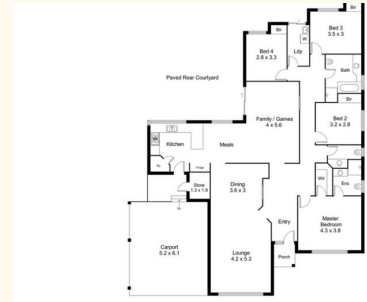
LJ Hooker 29 Diamond Drive, Ocean Reef

joondalup.ljhooker.com.au | admin.joondalup@ljhooker.com.au