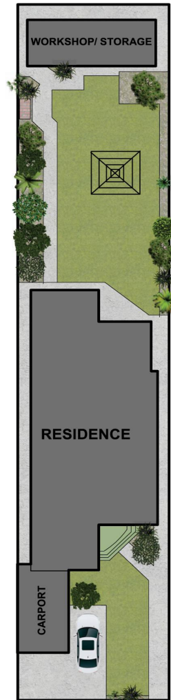
GENERAL SITE PLAN (NOT TO SAME SCALE)