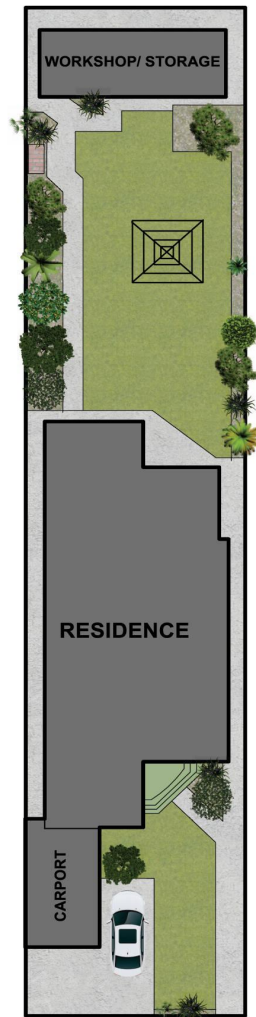
GENERAL SITE PLAN (NOT TO SAME SCALE)