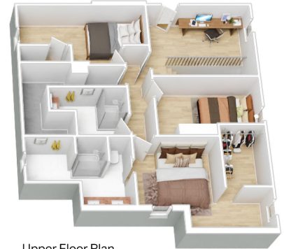
Upper Floor Plan

The floor plan is not to scale; measurements are indicative and in metres. All features included in this 3D plan are for inspiration purposes only. This is not an exact replica of the property or the position of exterior elements. Plans should not be relied on. Interested parties should make and rely on their own enquiries.