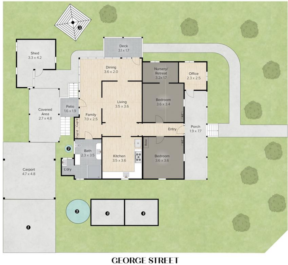
Floor & Site Plan