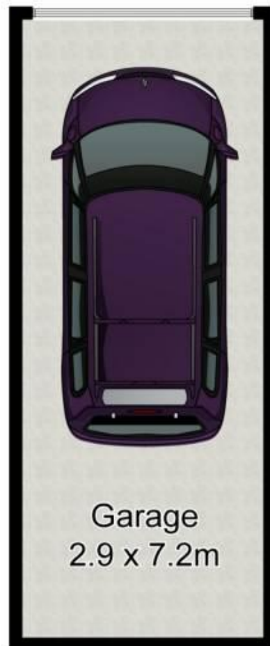
Garage 2.9 \times 7.2\text{m}