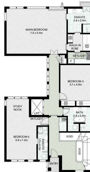
LEVEL THREE (ENTRY LEVEL)