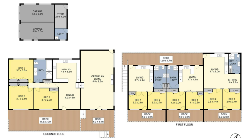
9 Harper Crescent, Narooma