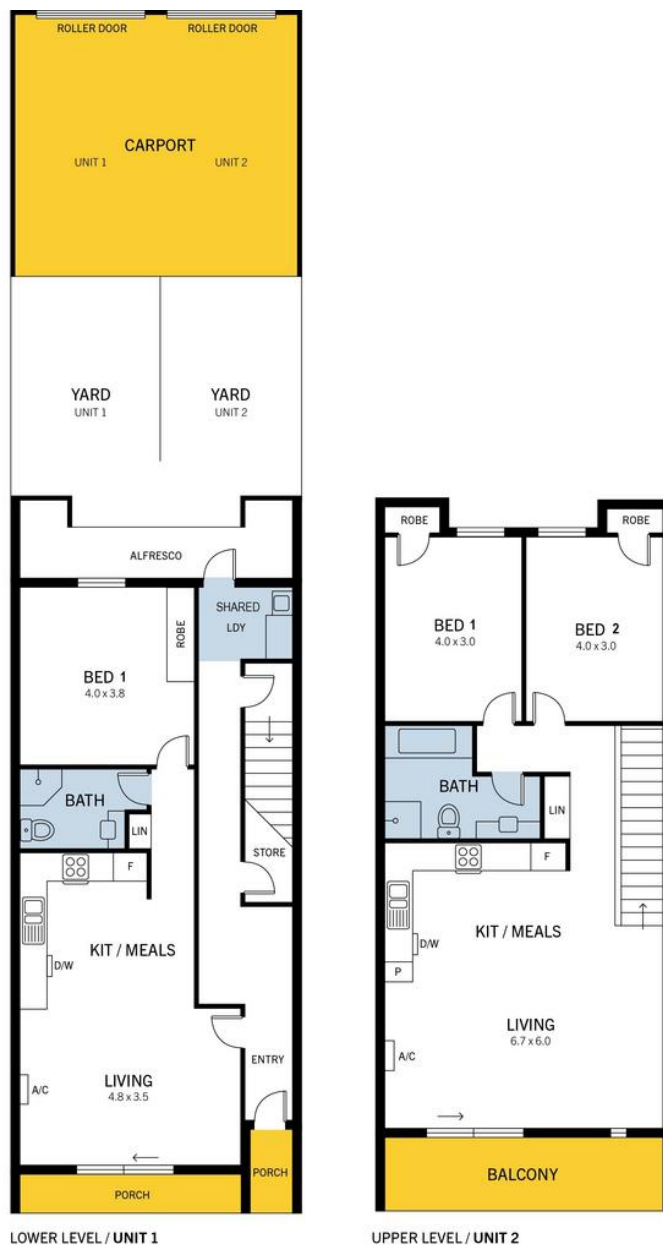
LOWER LEVEL / UNIT 1