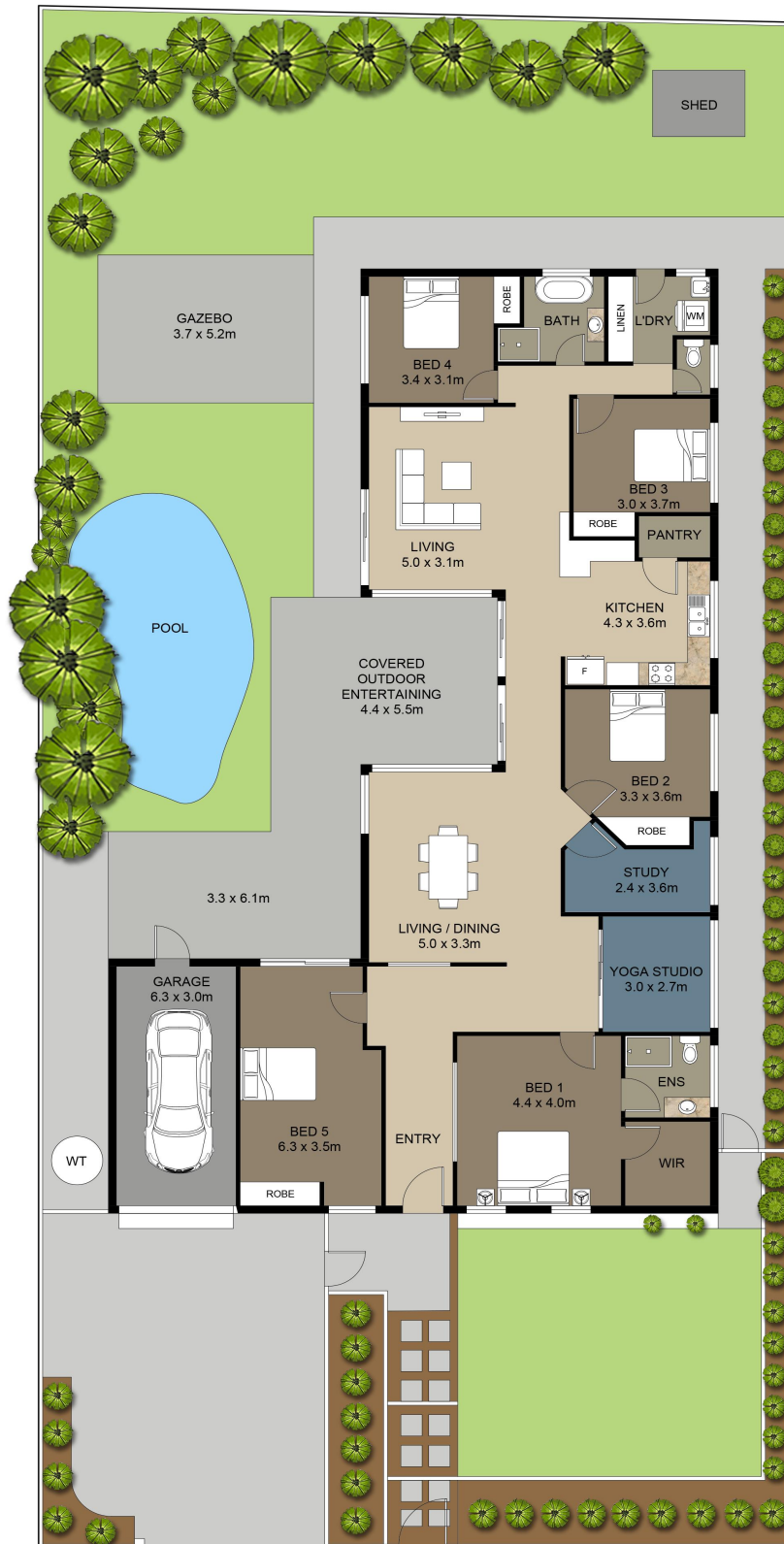
F L O O R P L A N O N S I T E P L A N