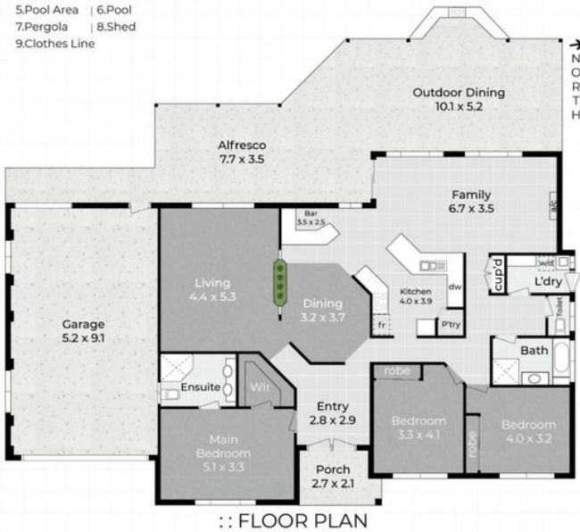
:: FLOOR PLAN