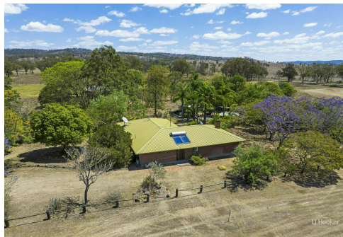
532 Old Mount Beppo Road, MOUNT BEPPO