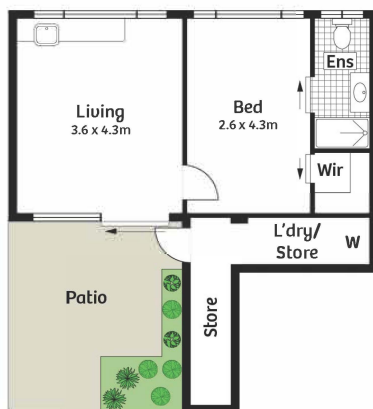
Grand Parent Accommodation