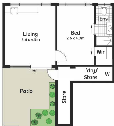
Grand Parent Accommodation