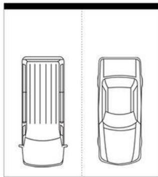
SECURE PARKING (5.2m x 5.6m)