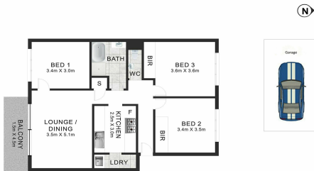
27/113 Karimbla Road, Miranda

LJ Hooker Caringbah (02) 9524 0111 2/381 Port Hacking Road, CARINGBAH NSW 2229 caringbah.ljhooker.com.au | caringbah@ljhooker.com.au