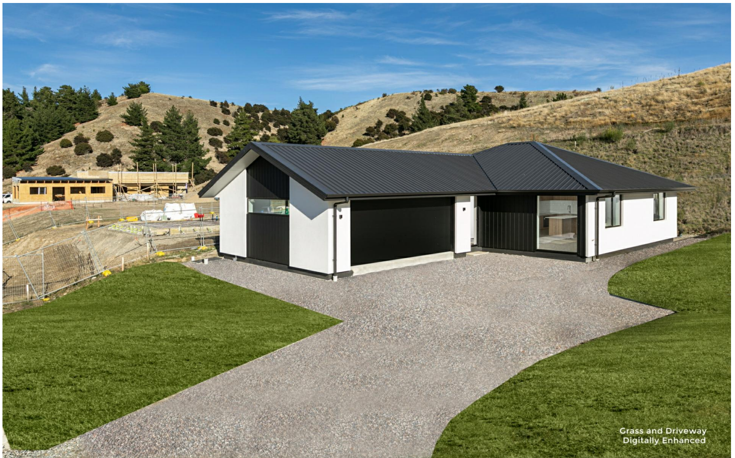
Grass and Driveway Digitally Enhanced