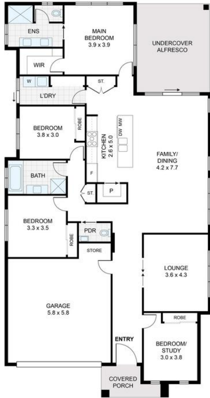
RESIDENCE : 217m 2