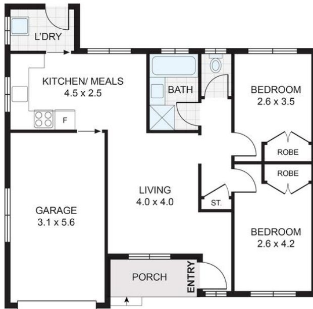
RESIDENCE : 80m 2