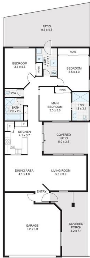
RESIDENCE : 173m 2