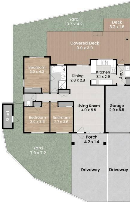
19/64 Brown Street Labrador