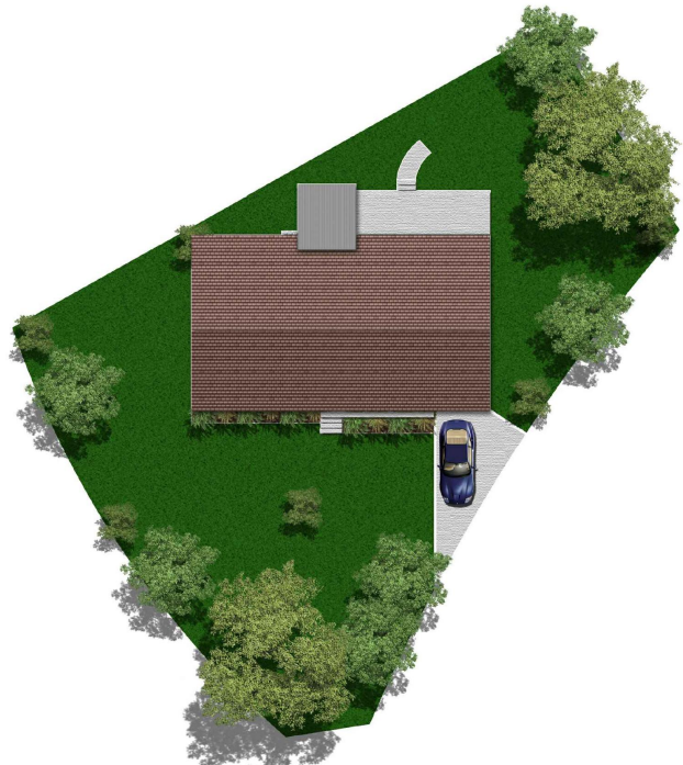
SITE PLAN - (NOT TO SCALE)

The site plan and floor plan are not to scale; measurements are indicative and in meters. Bushes and trees are placed for illustration purposes. Plans should not be relied on. Interested parties should make and rely on their own enquire. All other information provided has been collected from reliable sources but cannot be guaranteed for accuracy.