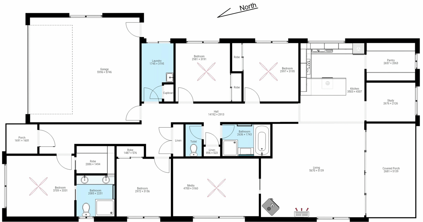
7 Kurrajong Cres Kalaru

This plan is intended for marketing purposes only. All dimensions are approximate.