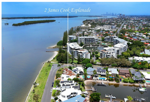
2 James Cook Esplanade