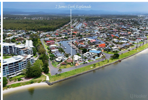
2 James Cook Esplanade