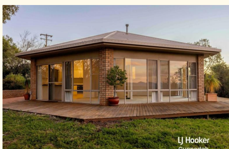
LJ Hooker Gunnedah