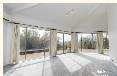
LJ Hooker Gunnedah