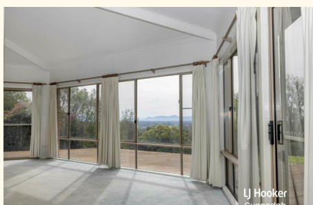
LJ Hooker Gunnedah