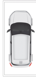
SECURE CAR SPACE (NOT IN POSITION)