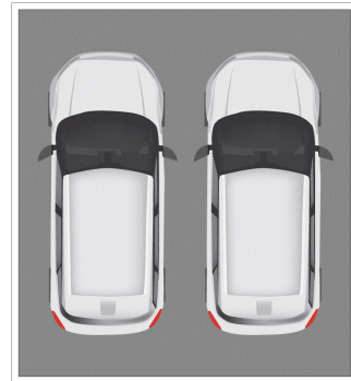
DOUBLE CAR SPACES (NOT IN POSITION)