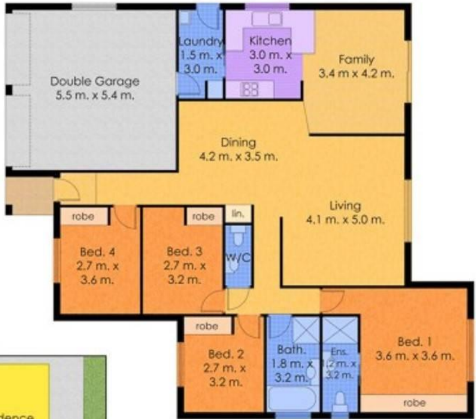
Floor Plan Total Internal Floor Area: 158 sqm