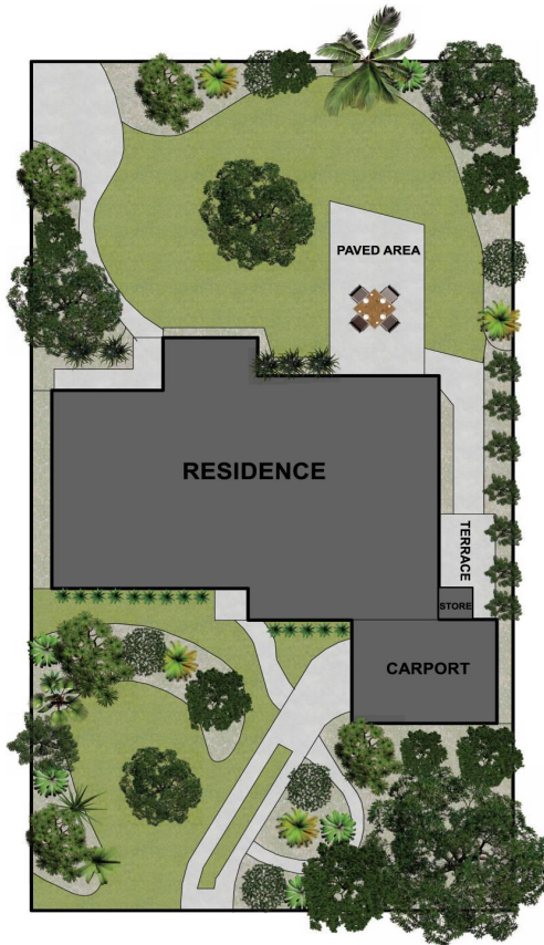
GENERAL SITE PLAN (NOT TO SAME SCALE)