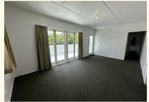
31 Mack Street, ESK

221 Ipswich Street, ESK QLD 4312 esk.ljhooker.com.au | esk@ljhooker.com.au