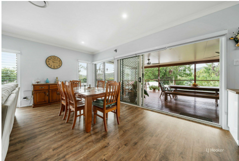
12 Mack Street, ESK