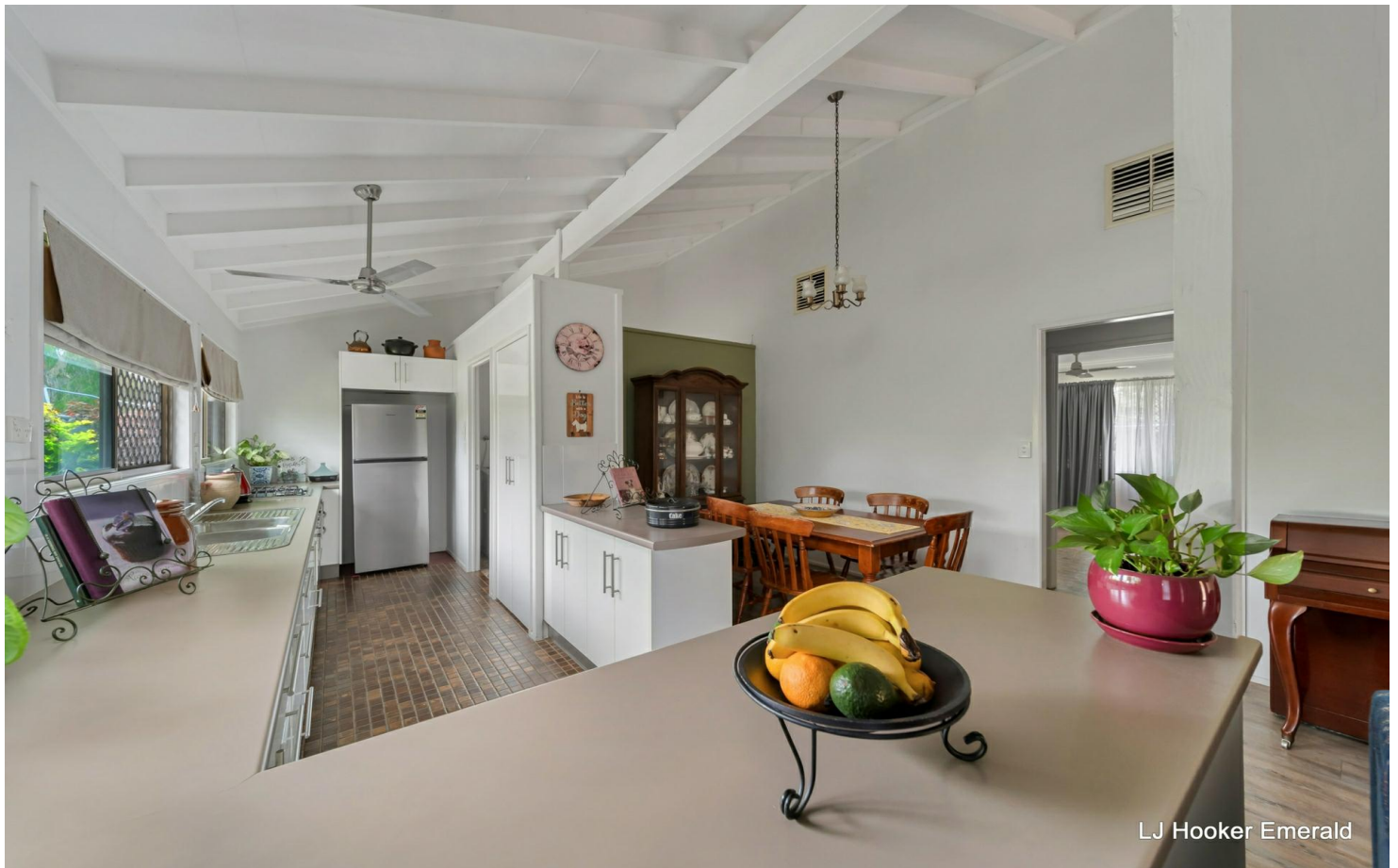
LJ Hooker Emerald