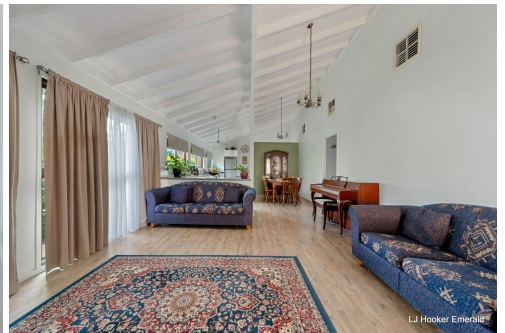
LJ Hooker Emerald