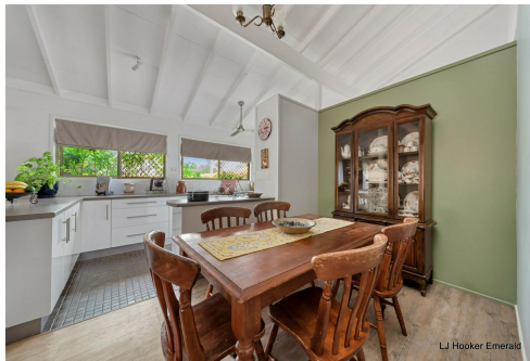
LJ Hooker Emerald