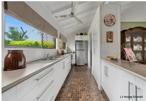
LJ Hooker Emerald