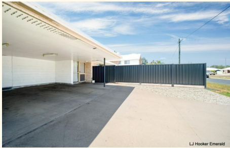
LJ Hooker Emerald