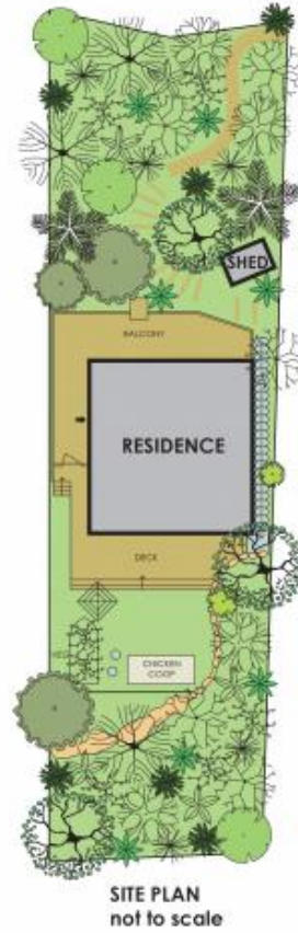
SITE PLAN not to scale