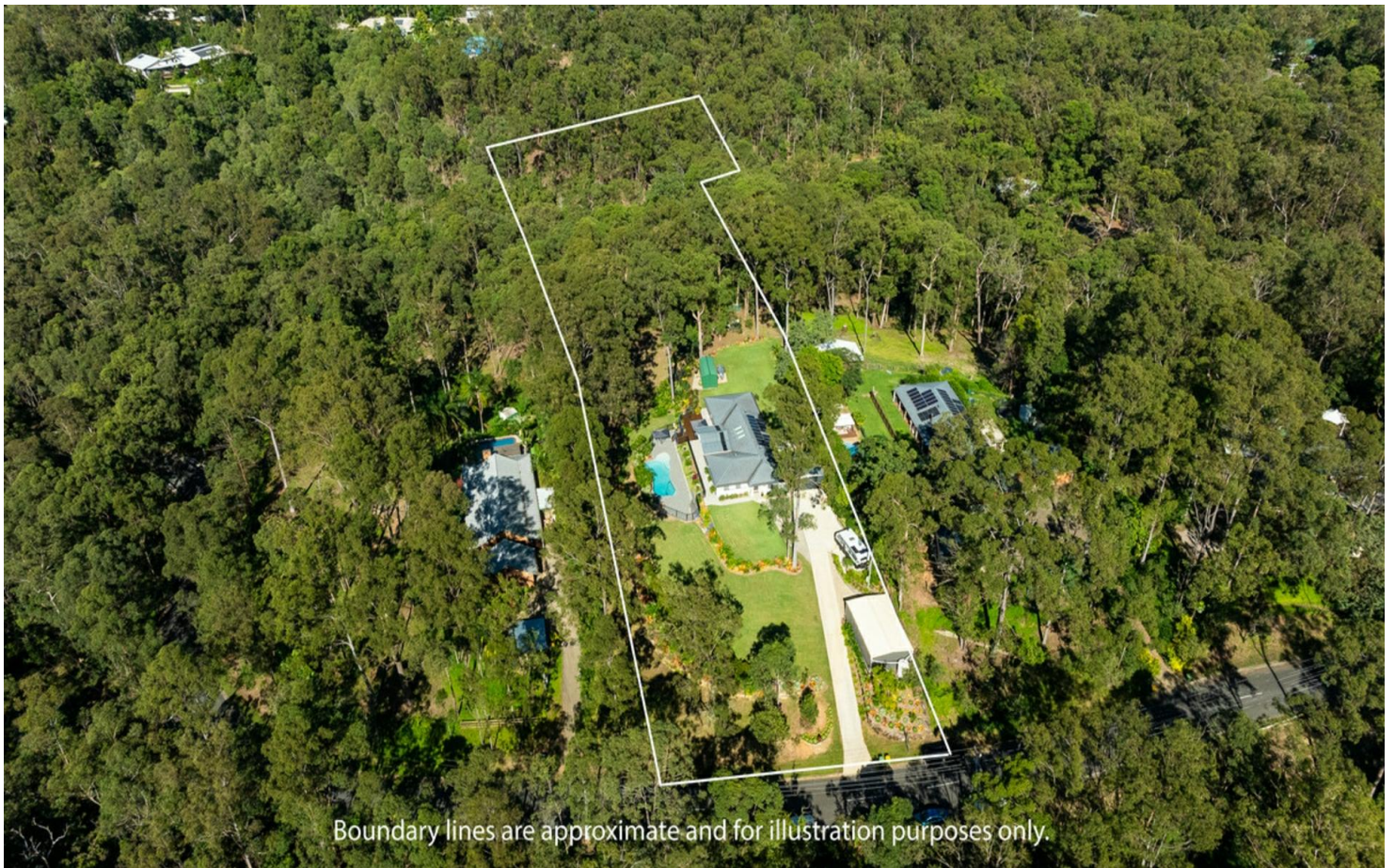
Boundary lines are approximate and for illustration purposes only.