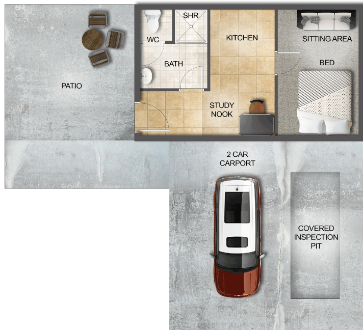
MAIN BUILDING PLAN

This floor plan including furniture, fixture measurements and dimensions are approximate and for illustrative purposes only. BoxBrownie.com gives no guarantee, warranty or representation as to the accuracy and layout. All enquiries must be directed to the agent, vendor or party representing this floor plan.