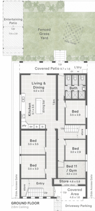
GROUND FLOOR 2.6m Ceiling