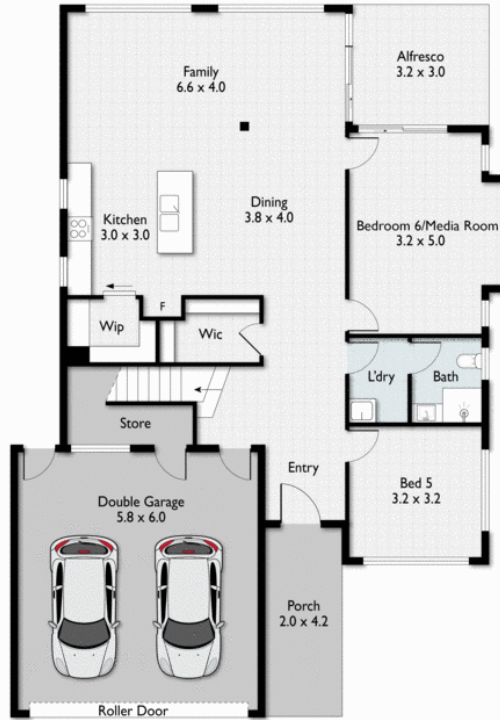
Ground Floor 2.52m Ceiling Height