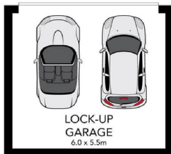
LOCK-UP GARAGE 6.0 x 5.5m