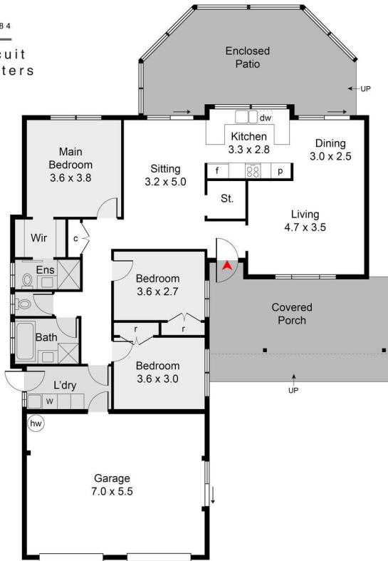
RESIDENCE : 163m 2 (INCLUDES GARAGE)