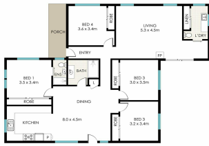
5A RIVER STREET, CUNDLETOWN Floor plan measurements are approximate and are for illustrative purposes only. FloorPlanCity.com.au/Property/5a-river-street-cundletown