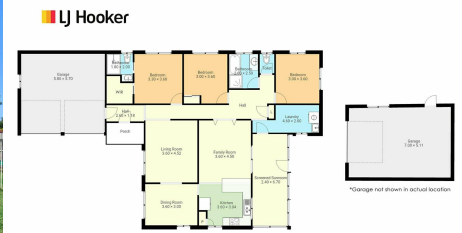
14 River Street, Cundletown NSW This floor plan including fixture measurements and dimensions are approximate and for illustrative purposes only.