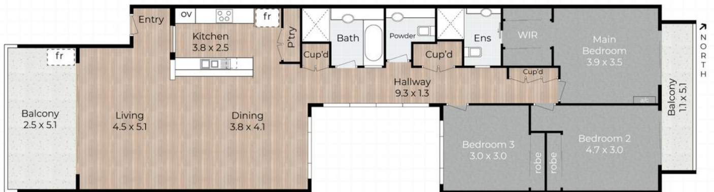
:: FLOOR PLAN

MING BODY PROPERTIES Ming Body 0418 297 978