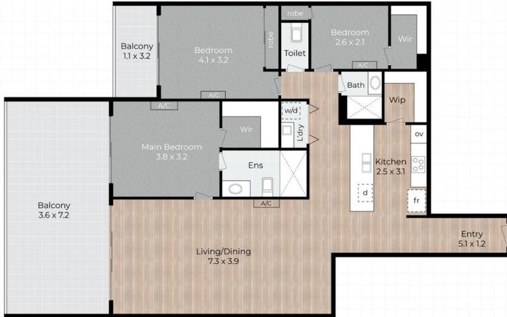
:: FLOOR PLAN

MING BODY PROPERTIES Ming Body 0418 297 978