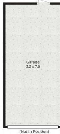
:: FLOOR PLAN