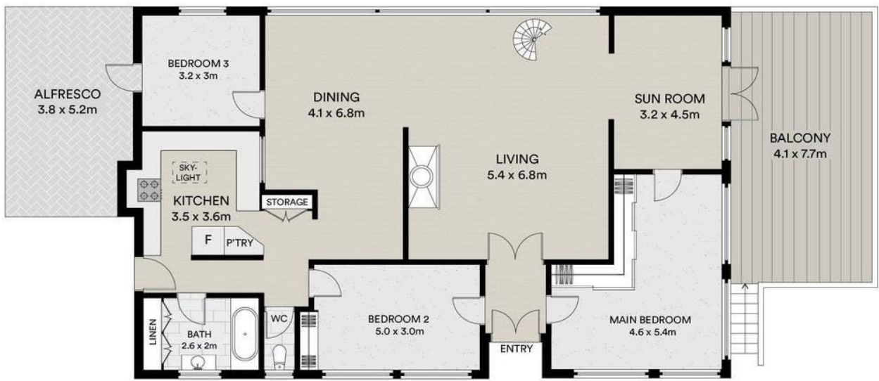
FIRST FLOOR (STREET LEVEL)