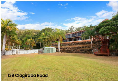
139 Clagiraba Road