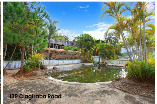
139 Clagiraba Road