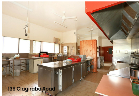
139 Clagiraba Road